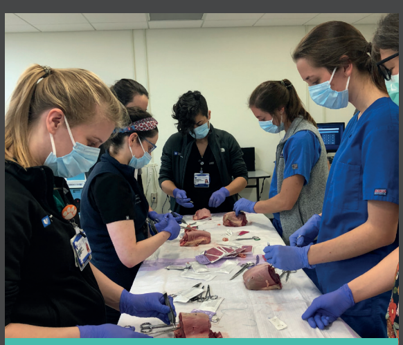
Gynecologic trainees in the suture laboratory practice to suturing

Balancing research, surgery and education during my work is not easy, and it can get very busy. There are times I need to prioritise tasks, so staying organised and preparing ahead of time to meet specific deadlines is very important. I am passionate about all three areas and strive to do my best in each of them.